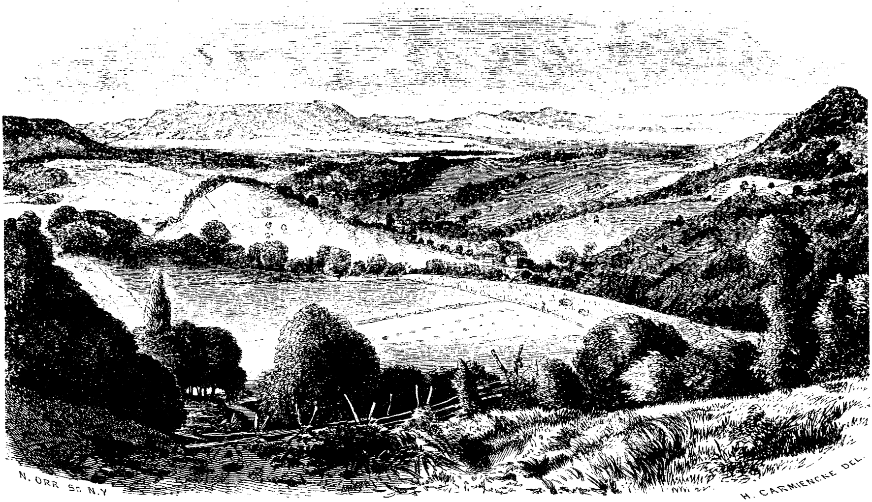
TROWBRIDGE MOUNTAIN AND WATNONG PLAINS, FROM SUGAR LOAF HILL, MORRIS CO.